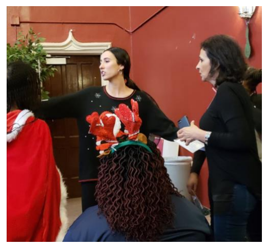
Barton students performing ballet and singing Christmas songs