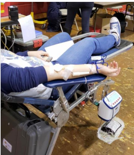
Student donating blood @ Hubbard High School