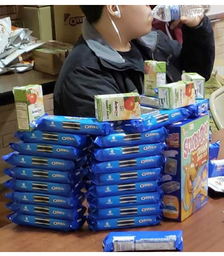
Sugar station for students that donated blood

When we arrived to the school, an ROTC officer escorted us to the blood drive. There were loads of students waiting to participate. They had a registration table and seating area. Beyond that point they had another waiting area for students to be called to take the questionnaire to find out if they were eligible to donate. If not, they could go back to class. If they were good candidates, they went on to the blood drawing area where they were greeted by the nurses and technicians who would draw their blood. Once they donated, they would rest to make sure they were able to move on to the next section. The next and final section was the sugar station. There were cookies, juice, etc. The students finished their goodies and then returned to class.